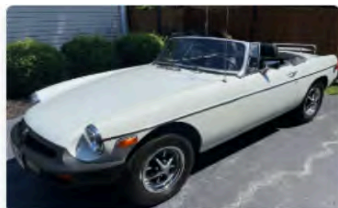
1977 MG MGB Roadster