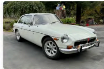
1970 MG MGB GT