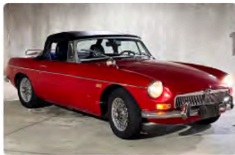
1969 MG MGB Roadster