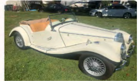
1954 MG TF