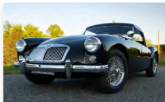
25-Years-Owned 1.8L-Powered 1959 MG MGA Roadste...