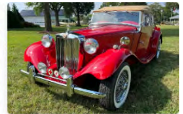
1952 MG TD