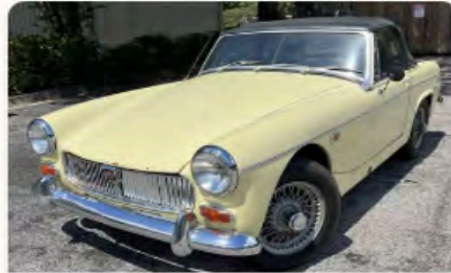
1969 MG Midget