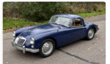
1957 MG MGA Coupe