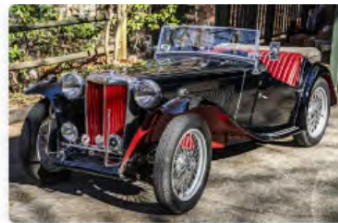
1948 MG TC