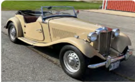
1951 MG TD