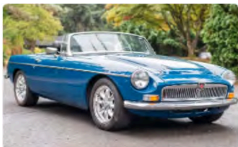
302-Powered 1974 MG MGB Roadster 5-Speed