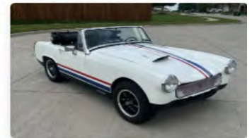
1979 MG Midget