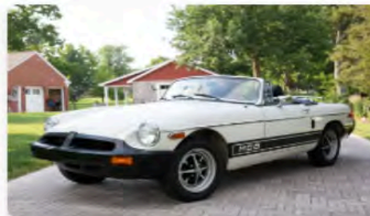
1979 MG MGB Roadster