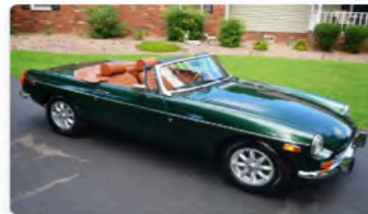
1973 MG MGB Roadster