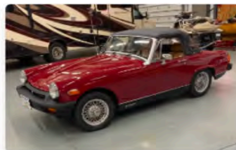
1977 MG Midget