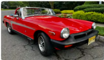
1976 MG Midget