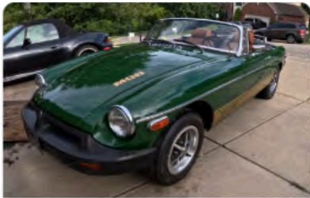
1977 MG B