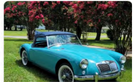
1957 MG A