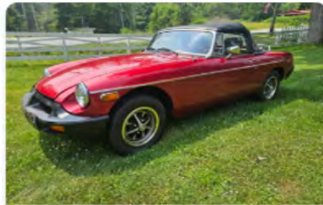
1979 MG B