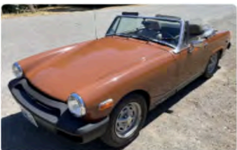
36-Years-Owned 1979 MG Midget