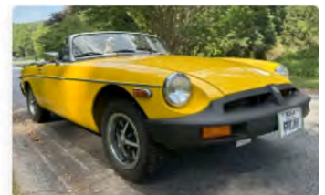
1978 MG MGB Roadster