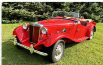
1953 MG TD