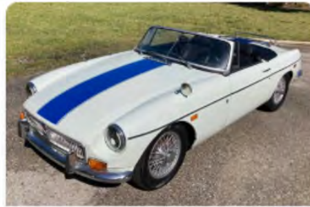
1969 MG B