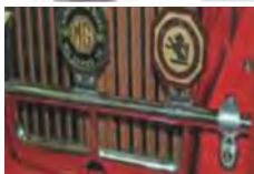
HIGHLY POLISHED CLOISSONNE/CHROME