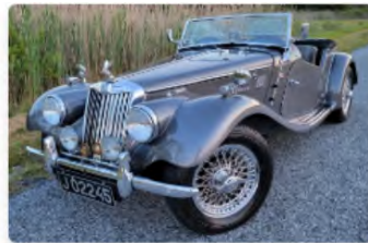
1955 MG TF 1500 5-Speed