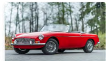
MG MGB Roadster