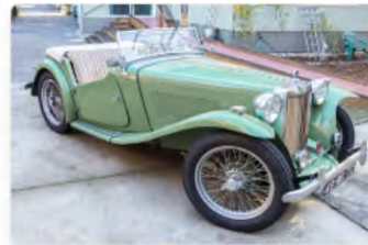
38-Years-Owned 1948 MG TC