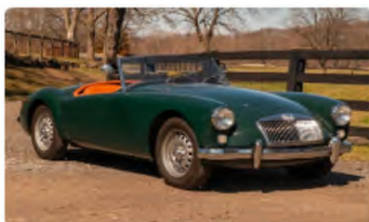
1958 MG MGA Twin Cam Roadster