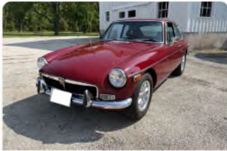
1973 MG BGT