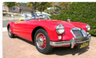
64-Years-Family- Owned 1958 MG MGA Roadster