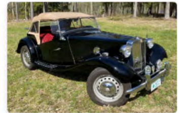
1953 MG TD