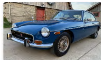
32-Years-Owned 1971 MG MGB GT