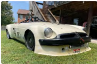
31-Years-Owned MG MGB Race Car