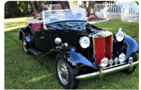
1952 MG TD