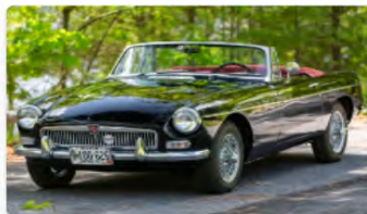
1966 MG MGB Roadster