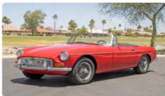
28-Years-Owned 1965 MG MGB Roadster