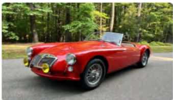
1960 MG MGA 1600 Roadster