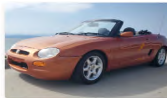
1996 MG MGF