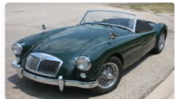
1.8L-Powered 1956 MG MGA Roadster