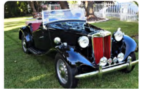
1952 MG TD