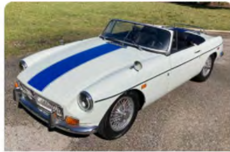
1969 MG B