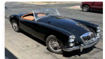
MG MGA Roadster Project