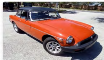
1977 MG MGB Roadster