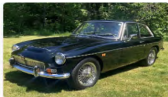
1969 MG MGC GT