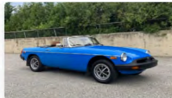
1978 MG MGB Roadster