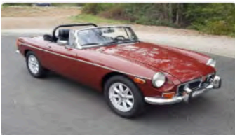
V8-Powered 1974 MG MGB Roadster 5-Speed