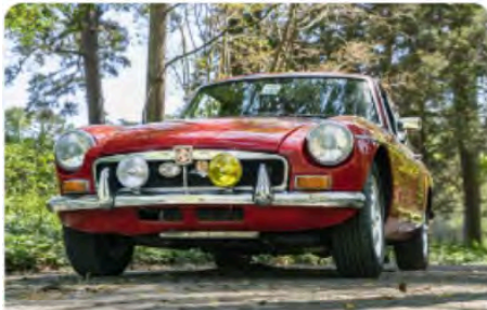
1974 MG BGT ☆