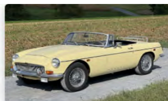
1969 MG MGC Roadster