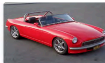
Supercharged LT1- Powered Widebody 1966 MG MGB...