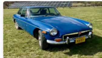
30-Years-Owned 1974 MG MGB GT