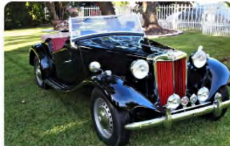
1952 MG TD ☆