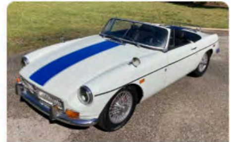
1969 MG B ☆