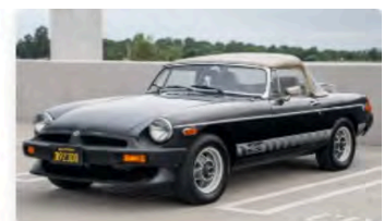
1980 MG MGB Limited Edition