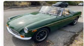
1979 MG MGB Roadster