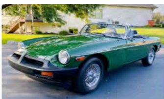
1980 MG MGB Roadster