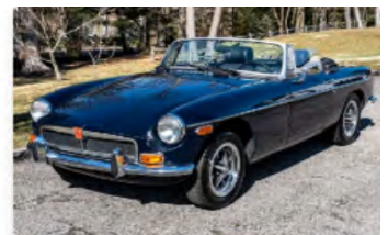
1973 MG MGB Roadster