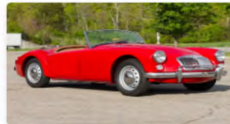
MG MGA Roadster