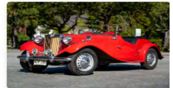
41-Years-Owned 1952 MG TD