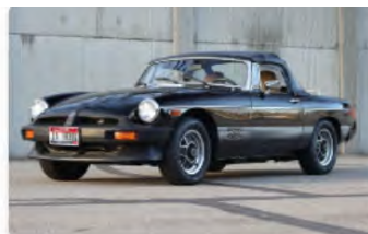
1980 MG MGB Limited Edition