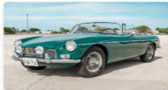
28-Years-Family-Owned 1967 MG MGB Roadster