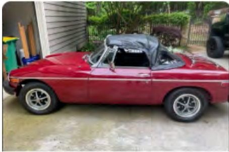
1975 MG B