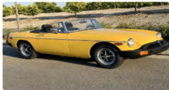
1979 MG MGB Roadster