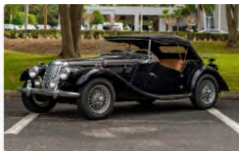
1954 MG TF