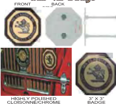
HIGHLY POLISHED CLOISSONNE/CHROME