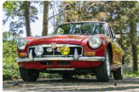
1974 MG BGT