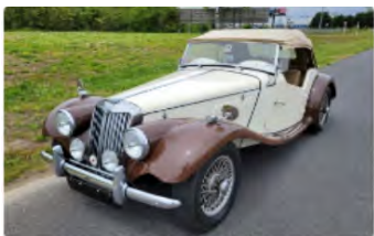
1954 MG TF