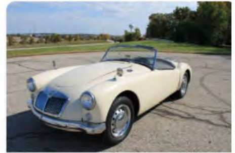
1957 MG A