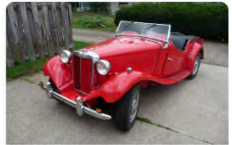
1952 MG TD ☆