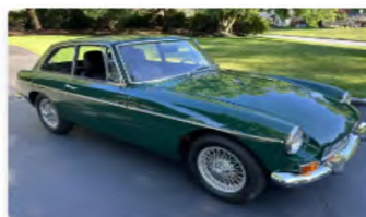
1969 MG MGB GT