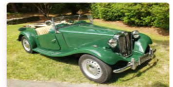
1952 MG TD