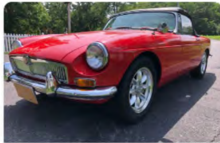
1966 MG B ☆