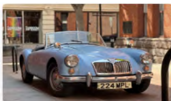
1960 MG MGA 1600 Roadster