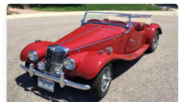
1954 MG TF