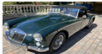
Supercharged 1.8L- Powered 1961 MG MGA 1600 Roadster