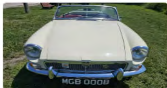
22-Years-Owned 1964 MG MGB Roadster