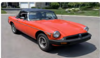
1979 MG MGB Roadster