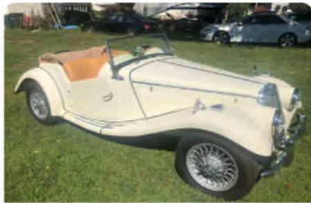
1954 MG TF ☆