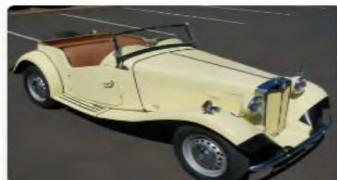
1953 MG TD/C Mark II