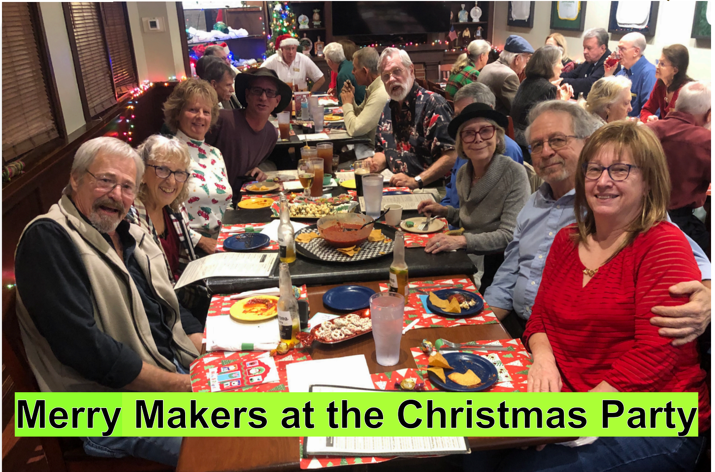
Merry Makers at the Christmas Party