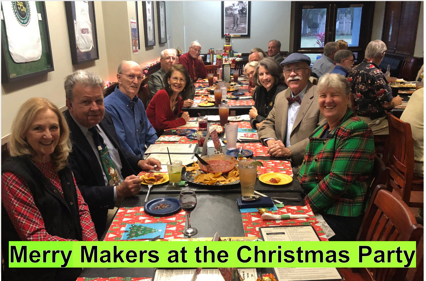
Merry Makers at the Christmas Party