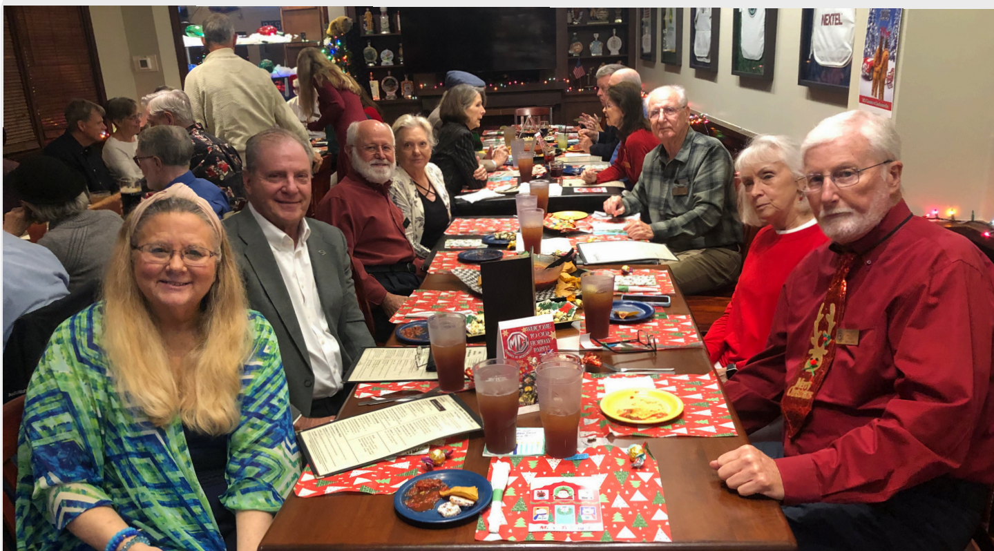
Merry Makers at the Christmas Party